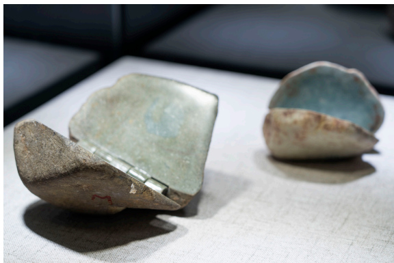
切问 - 玉原石 No.1 No.2/Qie Wen - Raw Jade No.1 No.2 (2020)

Stainless steel is a material that displays the resistance against nature that comes from human technology. Sights in the reflection are sometimes clear and sharp, sometimes rugged.