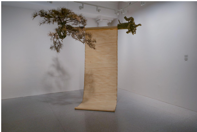
一棵松No.5/Pine No.5 (2016)