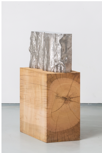
切问 - 不锈钢 B-10/Qie Wen - Stainless Steel B-10 (2017)